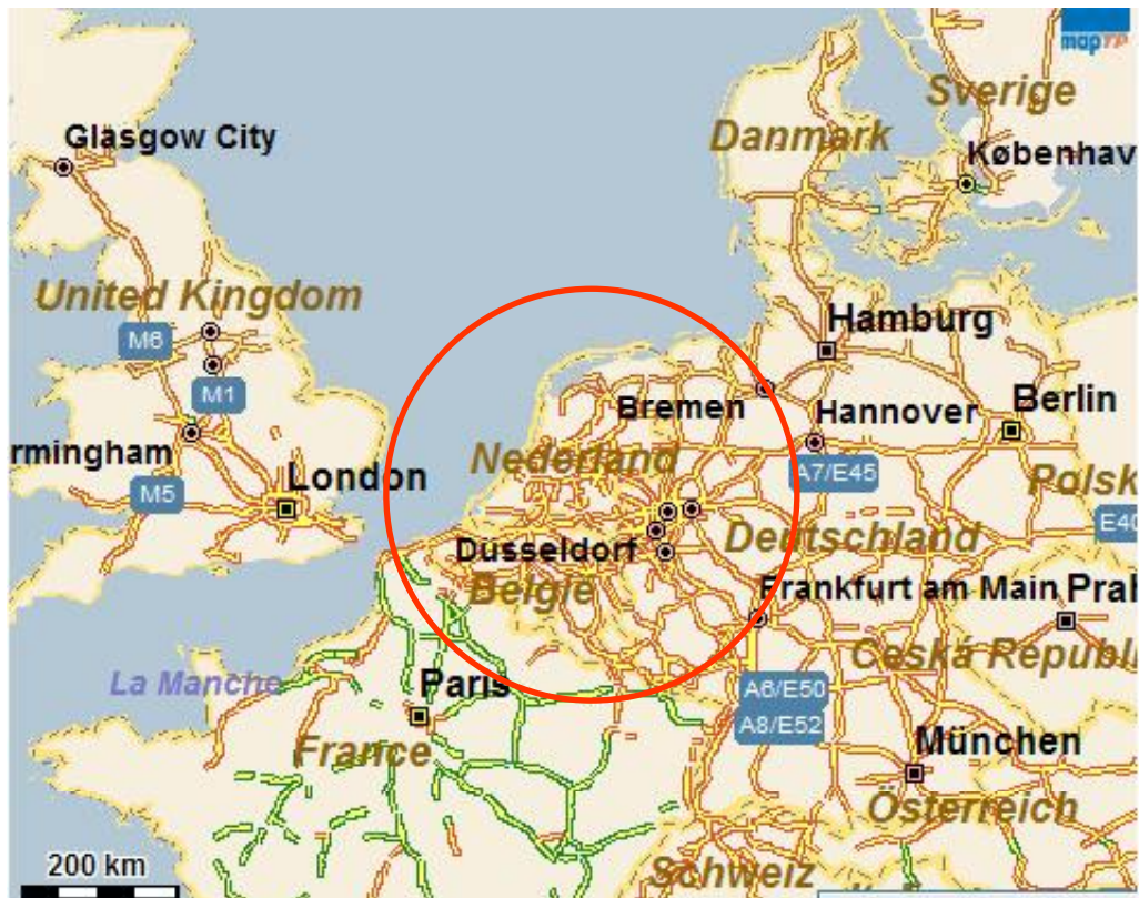
Figure 2. Map of the Netherlands.