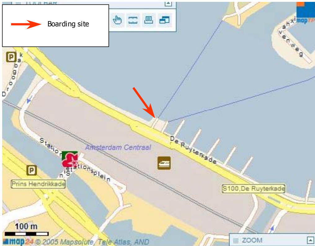
Figure 1. Boarding site at Monday the 20 th in Amsterdam. The boarding site is located directly behind the central train station.